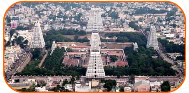
ARUNACHALESWAR TEMPLE THIRUVANNAMALAI