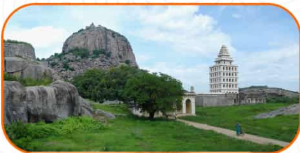
GINGEE FORT VELLORE