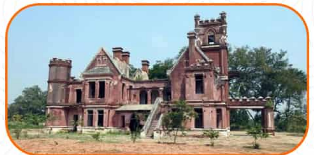
FRENCH FORT POOSIMALAI KUPPAM