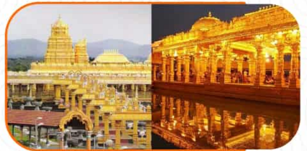
GOLDEN TEMPLE VELLORE