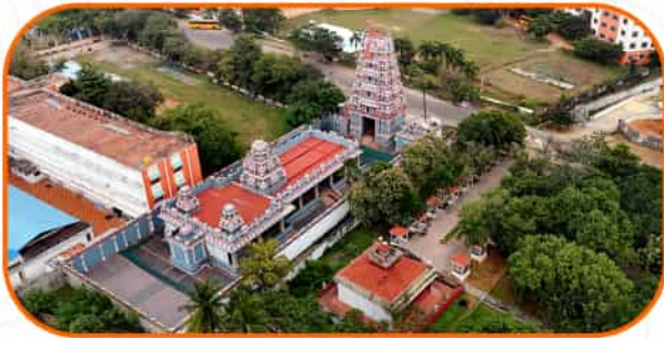
ACS PERUMAL KOVIL ARNI